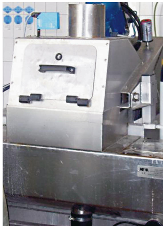
No odour problems due to the enclosed system