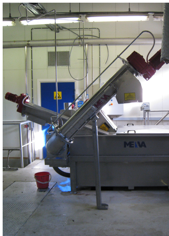
Meva SRS with a grit screw. Screen connected to SWP and CPS.