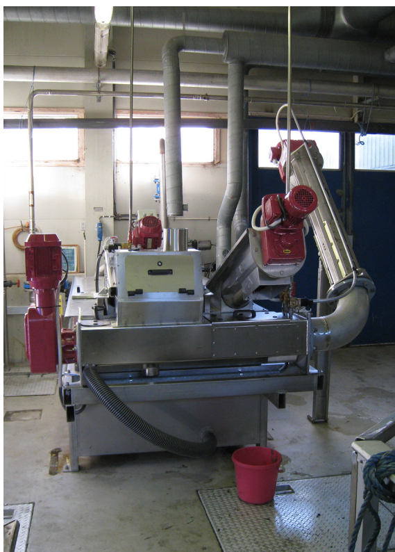
Meva SRS: Effective, Compact, Enclosed